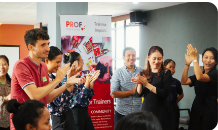
Trainers at Workshop, Hanoi, 2022