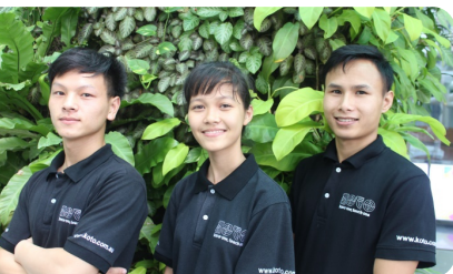
Students of KOTO, Vietnam